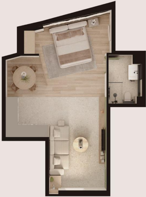
Studio -2 S=47,8m2