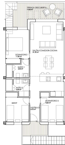
planta primera Sup. Construida VIV. = 80,46 m 2