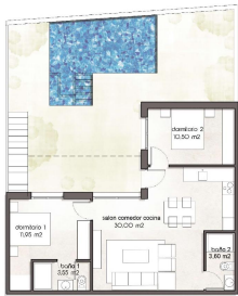
PB / GROUND FL.